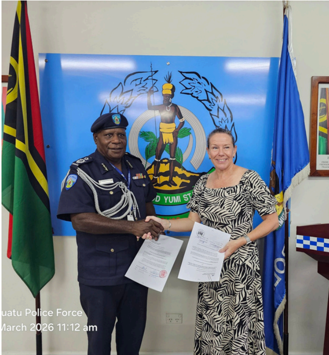
Vanuatu Police Force March 2026 11:12 am

The Vanuatu Police Force (VPF) and the Government of the United Kingdom signed a landmark Memorandum of Understanding (MOU) today aimed at strengthening law enforcement capabilities across Vanuatu.